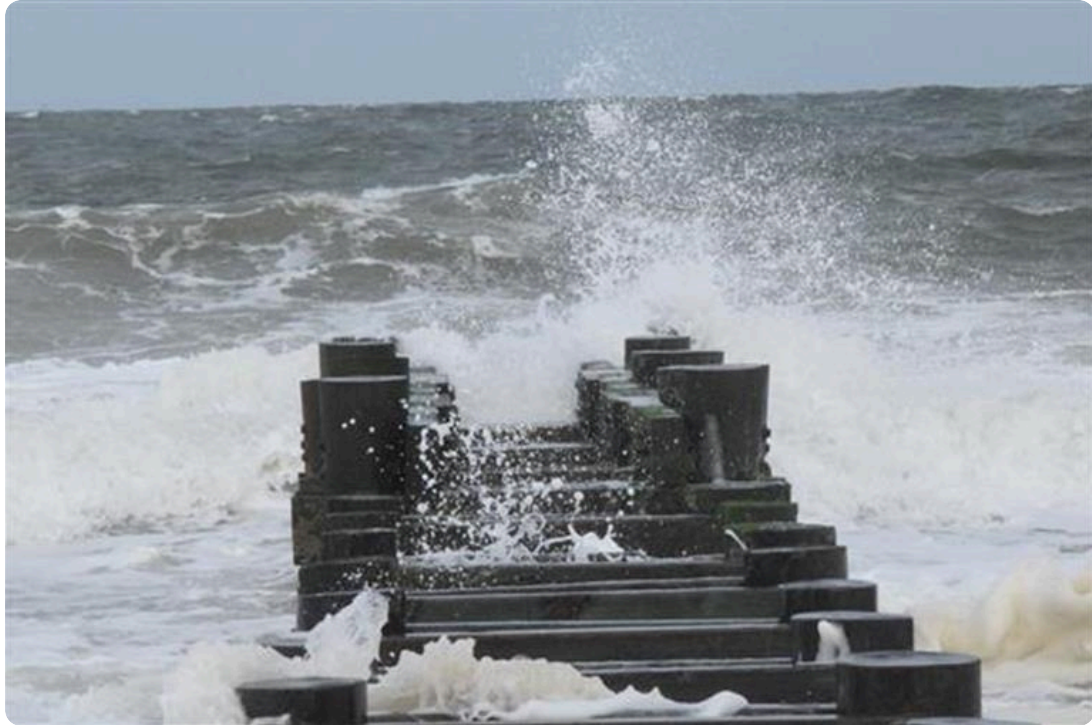
2019 -JTJ 1450 RB